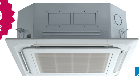
Ceiling Cassette Indoor Units