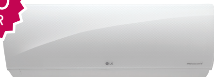
Art Cool™ Premier Supreme Efficiency Wall-Mounted Indoor Units