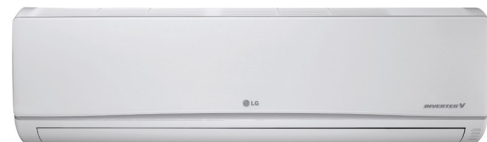
Multi F Standard High Efficiency Wall-Mounted Indoor Units