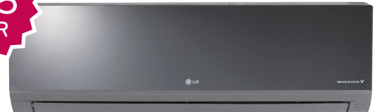
Art Cool™ Mirror High Efficiency Wall-Mounted Indoor Units