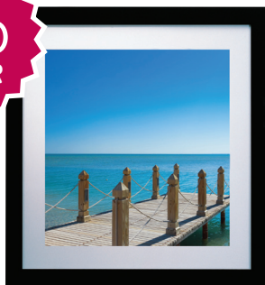
Art Cool™ Gallery Inverter Indoor Units