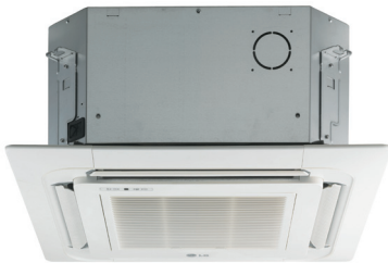
Multi F Ceiling Cassette Indoor Units