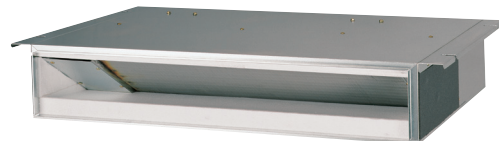
Multi F Ceiling Concealed Ducted Indoor Units