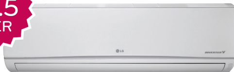
Standard High Efficiency Wall-Mounted Indoor Units